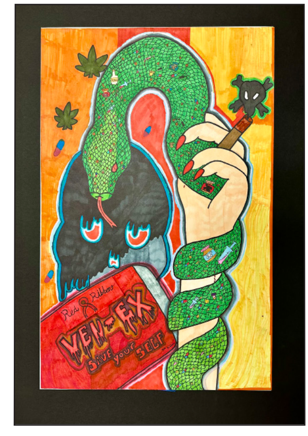
JULISSA CAMACHO IRMA MARSH MIDDLE SCHOOL